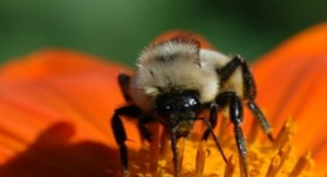
Bumble Bee (Bombus spp.)